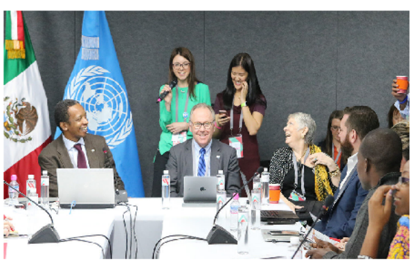
SF 2016

IGESA's role as a channel for additional funding for the IGE Trust Fund has been recognized by the UN through an exchange of letters. To date, IGESA has contributed USD 260,000 to the UN IGE Trust Fund and USD 225,500 to the NRIs.