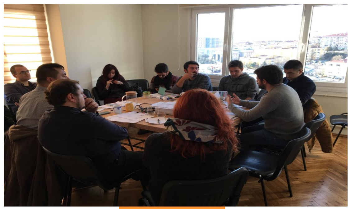
Turkey Youth IGF, 2016

The <u>Youth IGF Turkey</u> follows a similar organisational structure. Its organising committee is multistakeholder in nature, composed of members from three different stakeholder groups. Through an open call to gather topics of interest, invites youth to build the agenda, develop the substantive programme, and organise discussions.