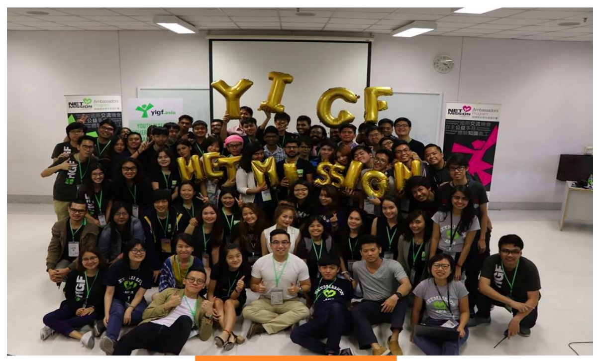
Asia Pacific Youth IGF, 2017

Another example of these practices is the Asia Pacific regional IGF (APrIGF). The youth group from NetMission.Asia, with support from APrIGF's Multistakeholder Steering Group (MSG), organises the <u>Asia Pacific Youth IGF Initiative</u> in parallel with the APrIGF annual meeting. With an aim of providing a unique discussion platform for youth with different backgrounds in terms of their professional interest, the organisers set up a three-to-four-day-long Internet Governance Camp. The camp's programme structure is close to the simulation of the IGF's multistakeholder approach. Participants are assigned a role of one of the four traditionally recognised groups within the Internet governance community.