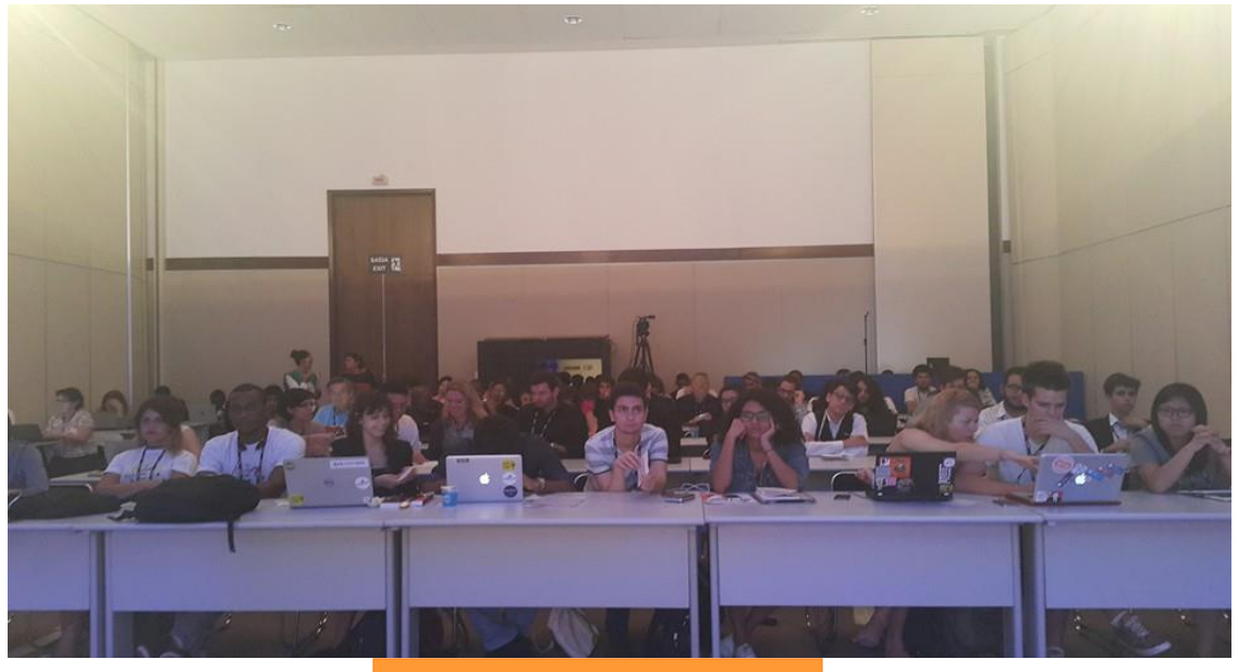
YCIG Session at the IGF 2015

The <u>Youth Coalition on Internet Governance (YCIG)</u> is one of the official Dynamic Coalitions (DCs) of the IGF. As per its own description, it is an open group for organizations and individuals, representing all stakeholder groups, willing to collaborate together in order to encourage and enrich youth participation in local, regional, and international Internet governance discussions and processes. Its main objective is to advocate for the voice of children, young people, and young professionals in Internet governance fora and processes. They hold regular online meetings, insitu meetings (such as during the annual IGF), and communicate with their network through a dedicated <u>mailing list</u>. Their engagement has resulted in many of the members of their network being appointed to leadership positions in many other Internet organisations.