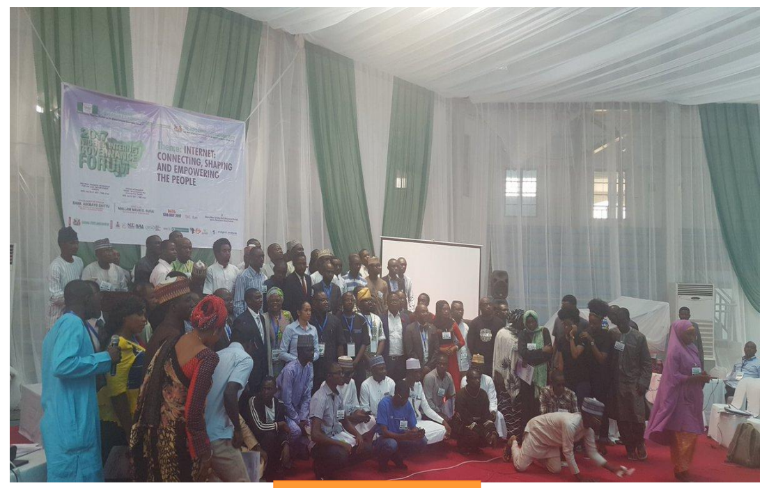
Nigeria IGF, 2017

Relevant experts produce specific case studies on a topic of interest, and commit to working with the young participants throughout the day in a format that emphasizes interactive discussion. The final outcomes are summarized in the written report, developed directly by youth participants. This report is integral part of the full report for the national IGF of Nigeria as well.