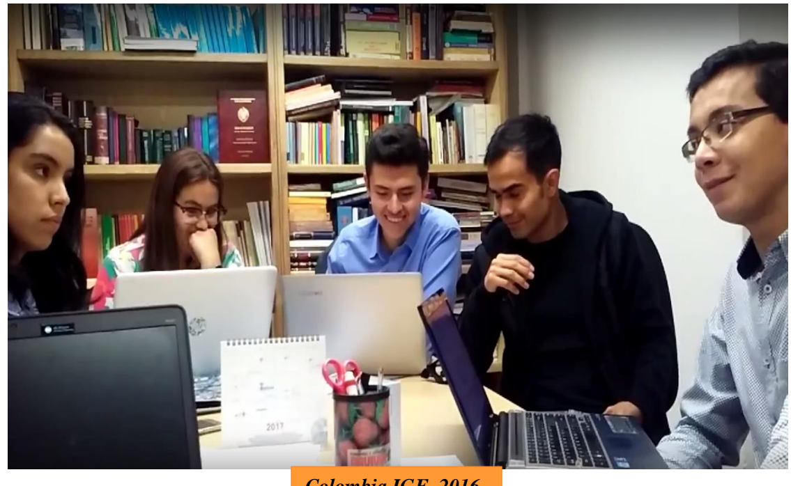
Colombia IGF, 2016

The national <u>IGF of Colombia</u> as well invests in youth engagement. Since 2013, the core multistakeholder organising team has organised a bi-monthly participation scheme through which all stakeholders are brought together to discuss the issues of local relevance, that are addressed during the annual IGF of Colombia. Since 2016, this initiative has successfully engaged and incorporated university students into the discussion, by empowering and encouraging them to express their views on different topics. Youth have created their own discussion structures through university research groups or by being professionally involved in nonprofit organizations whose work is related to the Internet.