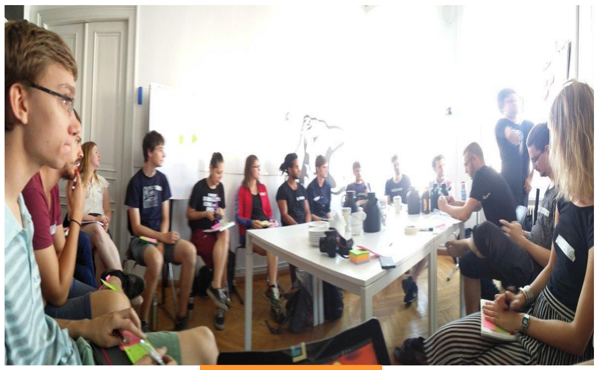
German Youth IGF, 2016

For example, the <u>German Youth IGF Initiative</u> is organised by a committee composed of five young people of different ages and genders with different educational backgrounds and from different parts of the country.