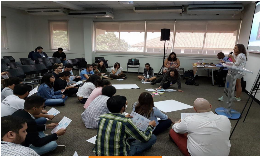
Youth LACIGF, 2017

The <u>Youth Latin American and Caribbean IGF (Youth LACIGF)</u> has been implementing this practice since 2016. Their initiative is independently organised by an organising committee composed of members that fit their definition of youth in addition to other stakeholders, while maintaining stakeholder, regional, and gender balance.