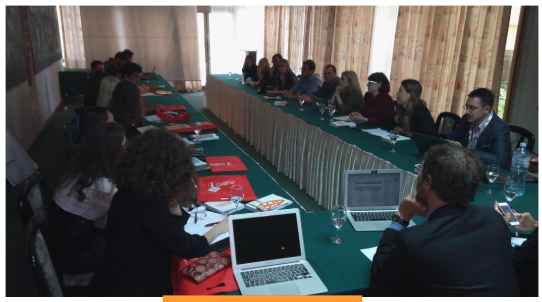
SEEDIG Youth School, 2017

One example is the South Eastern European Dialoge on Internet Governance (SEEDIG) – the subregional IGF for Southeastern Europe. In 2017, this IGF initiative organised its first Youth School, which had both online and in-situ components. Before the annual SEEDIG meeting, the Youth School participants were involved in webinars aimed at preparing them for participation in the SEEDIG meeting. During the SEEDIG event, a half-day-long session was held only for youth as a pre-event. This session was planned as a debate on a specific Internet governance-related case, in an attempt to prepare and encourage the youth members to actively participate in the subsequent