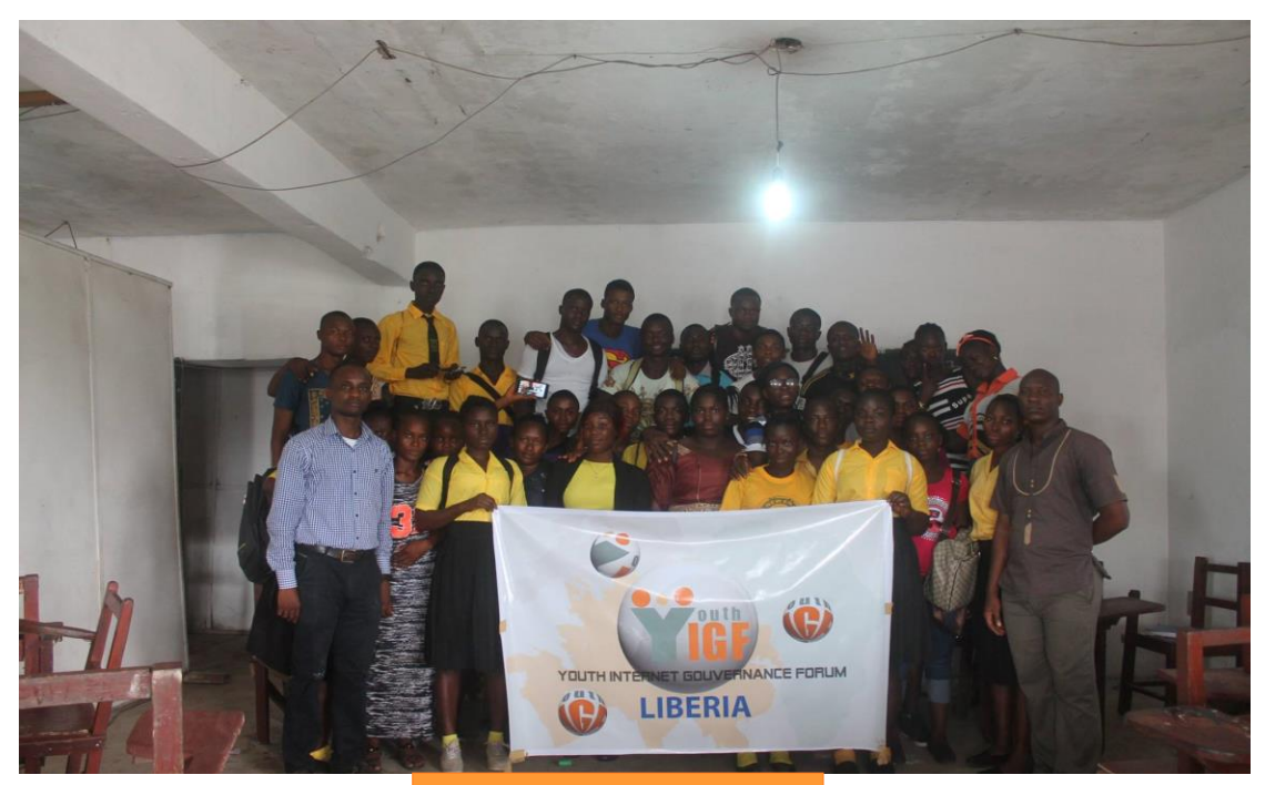
Youth IGF Movement Meeting in Liberia, 2016

For example, the <u>Youth IGF Movement</u> is an incentive that allows youth to discuss Internet governance topics of interest. This global movement of young people enables youth – described to be between 15 and 35 years old – to discuss and take a lead on issues related to Internet governance in the format of local, national, or regional debates. These debates are organised by youth on a volunteer basis based on the methodology provided by the Youth IGF Movement team, which respects the IGF's core principles. It enables the voice of young people to be heard by the Internet governance community, and to help youth take an active part in related decision-making processes.