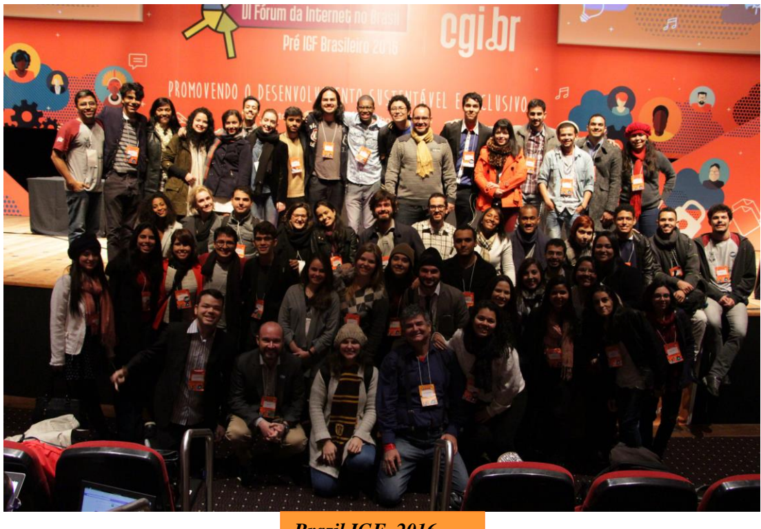
Brazil IGF, 2016

In 2016, the national IGF of Brazil created its <u>youth programme</u>, which engaged 50 young people from the Brazilian IGF community, in the IGF annual meeting hosted by the Government of Brazil in 2015. Prior to the IGF meeting, these participants completed a capacity building programme regarding the substantive processes of the Internet governance.