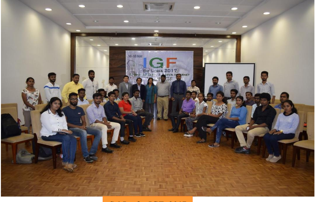
Sri Lanka IGF, 2017

Another practical example is the work conducted by the national <u>IGF of Sri Lanka</u>. The Sri Lanka IGF conducted a Youth IGF initiative alongside its 2017 annual meeting, where a set of focused thematic training sessions for youth took place. It was seen as a very good opportunity for youth to discuss Internet governance-related topics among themselves. This was an experimental setup for the preparations of the Youth IGF initiative, which will be organised independently by youth in 2018.