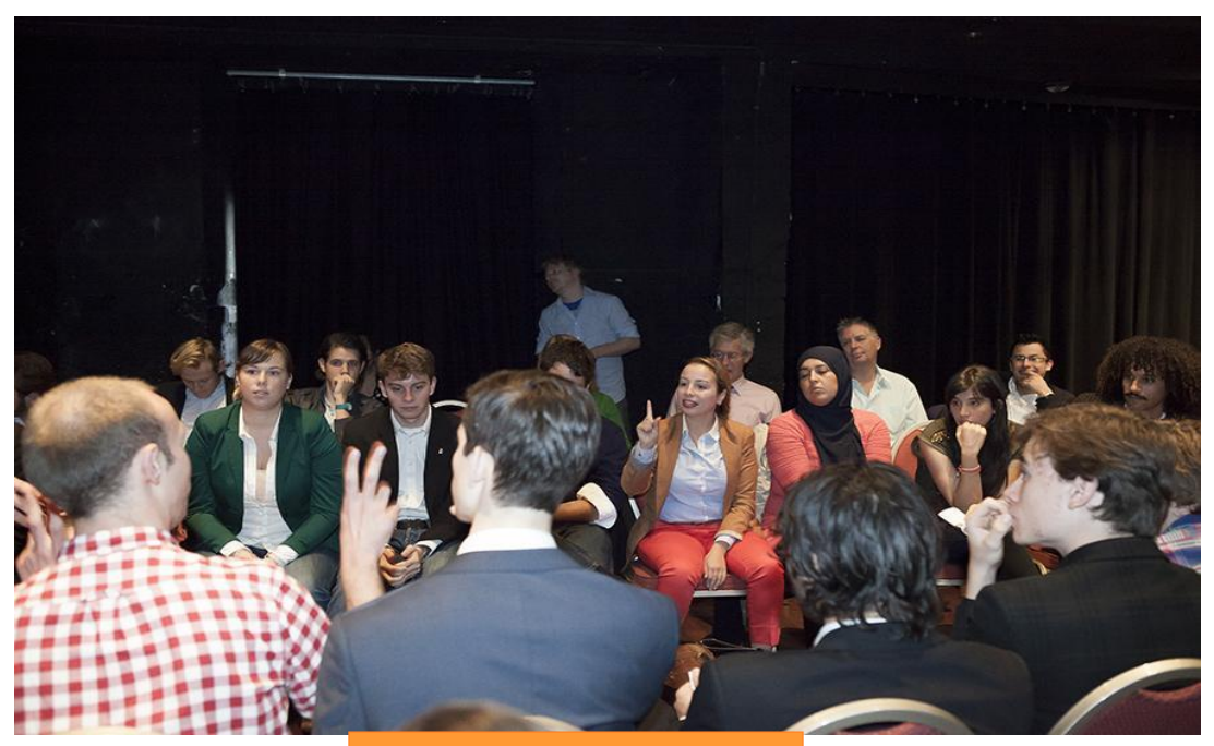
Netherlands Youth IGF, 2016

Youth discussions are sometimes summarised in written outcomes (youth messages), which became contributions to the NRI meeting itself.