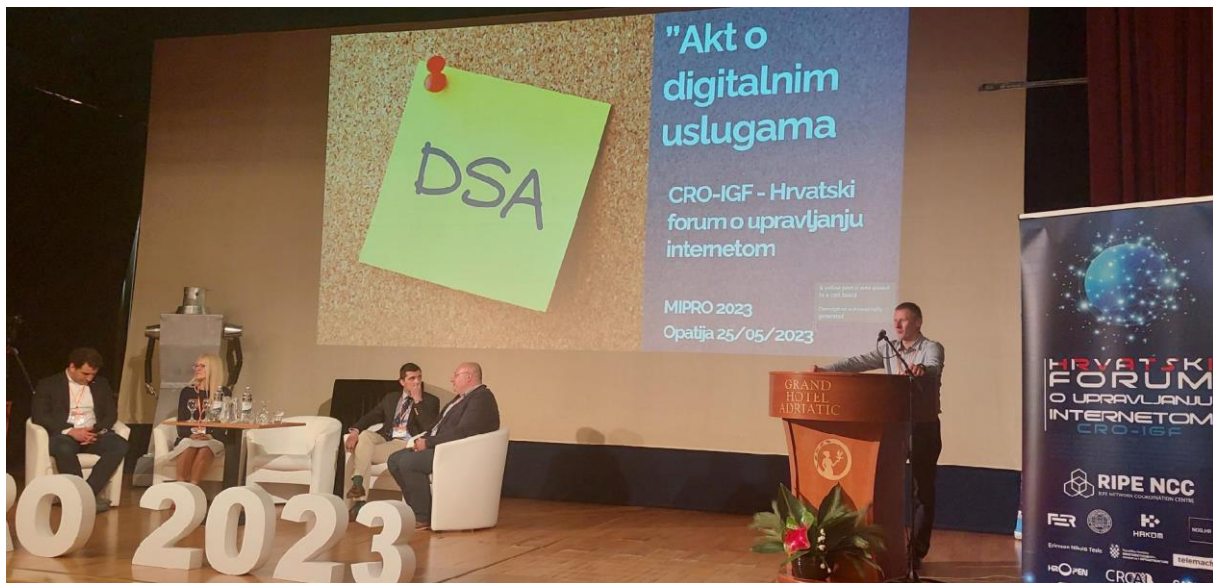
Participants in the panel discussion on DSA