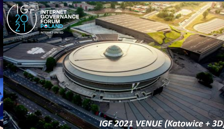
IGF 2021 VENUE (Katowice + 3D)