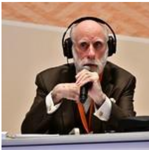
Vint Cerf, 'Father of the Internet' & UN IGF Leadership Panel Chair

For more photos, please visit: IGF-Internet Governance Forum's albums | Flickr