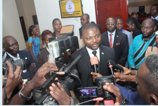
Mr Emery Okundji Ndjovu, Minister of Posts, Telecommunications and ICT

He also announced the launch of a new legal framework whose bills are at the level of parliament having as strong point: • Telecommunications and New Technologies of Information and Communication; • Trade and electronic commerce; • Cybercriminality.