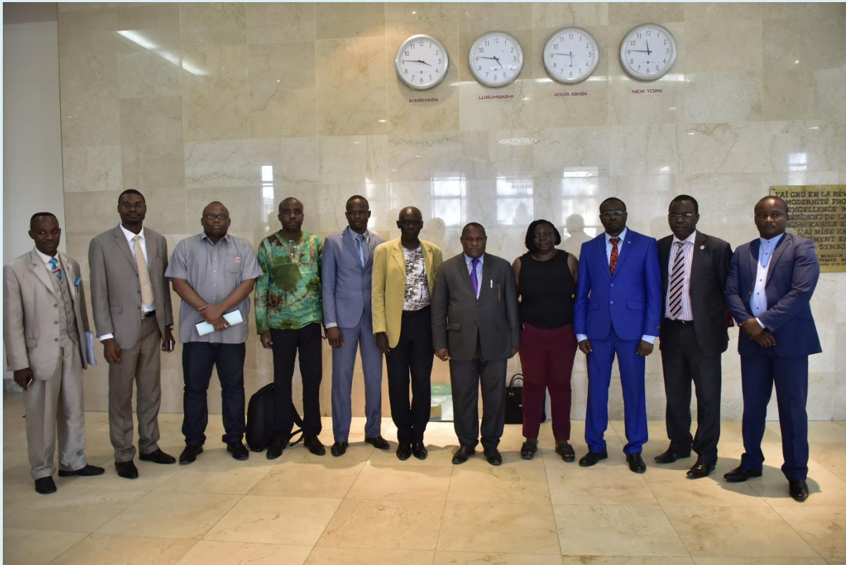
Kinshasa on January 14, 2018 EXECUTIVE SECRETARIAT OF IGF DRC