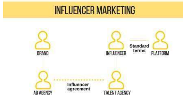
Figure 1 - Goanta & Wildhaber, 2020

sensu, namely to indicate those social media users who engage in influencer marketing as a business model (see Figure 1 below).