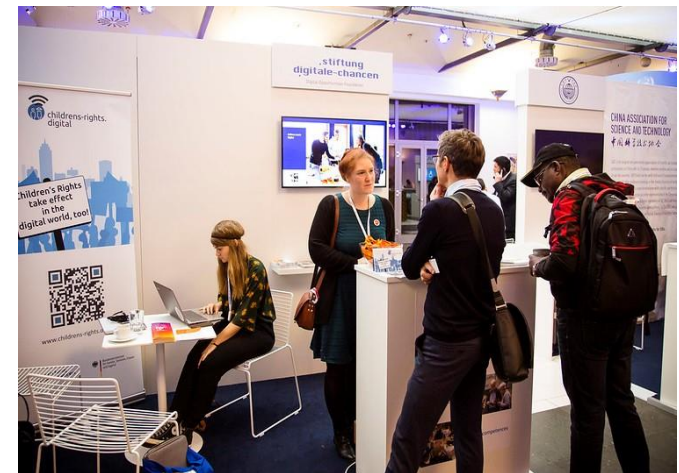
One of 55 booths at IGF 2019

Stakeholders can apply to display the Internet-governance relevant work activities. Booths are of non-commercial nature.