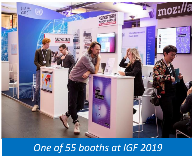
One of 55 booths at IGF 2019

All stakeholders can submit applications to display their Internet governance-related activities at the IGF Village exhibition booths until 22 April 2020 .