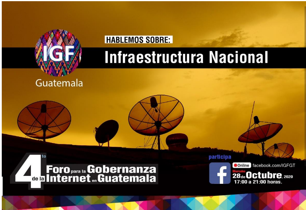
Invitation to the Infrastructure Forum.