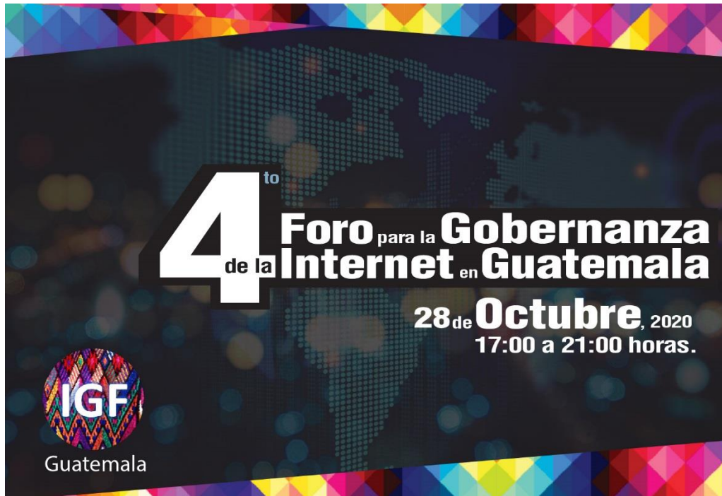
Invitation to the Forum.