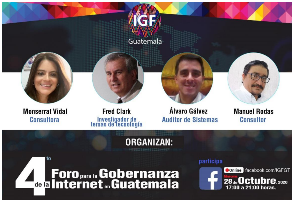
Invitation to the Forum.