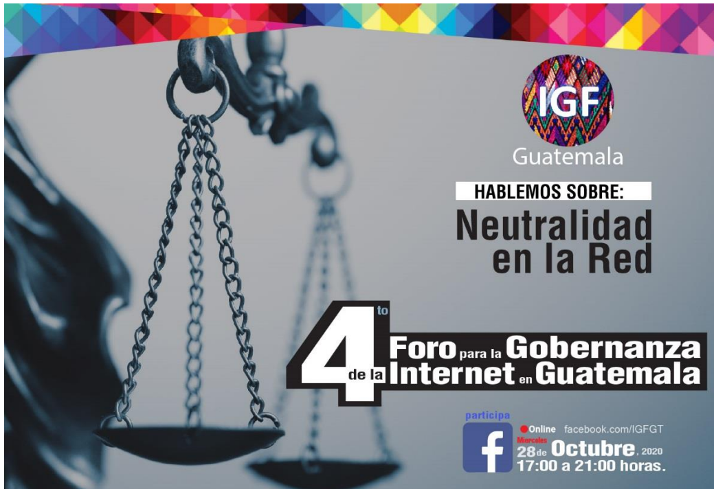
Invitation to the Network Neutrality Forum.