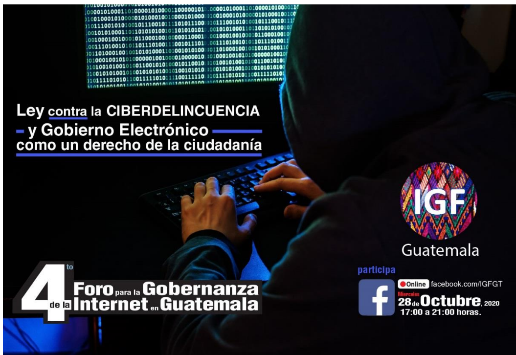
Invitation to the Cybersecurity Forum.