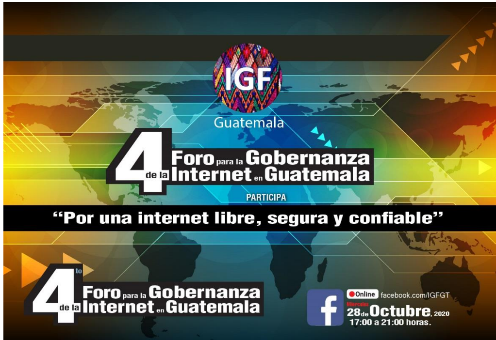
Invitation to the Forum.