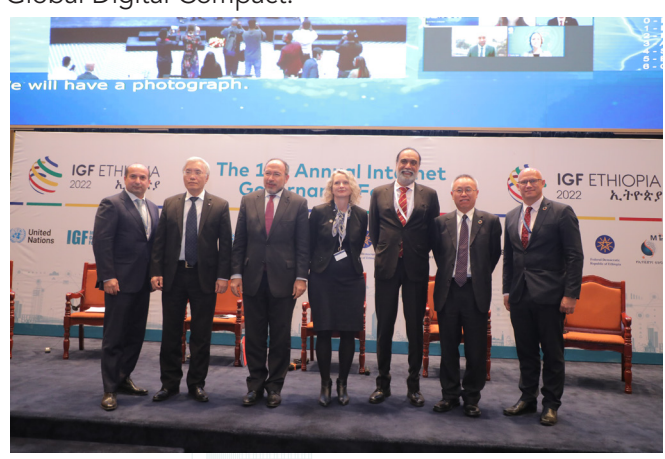
Speakers at the UN Forum

As well as the main session on Internet fragmentation, the auditorium will feature the work of the Forum's dynamic coalitions. Their session will explore how they can contribute to the evolution of the IGF and the Global Digital Compact.